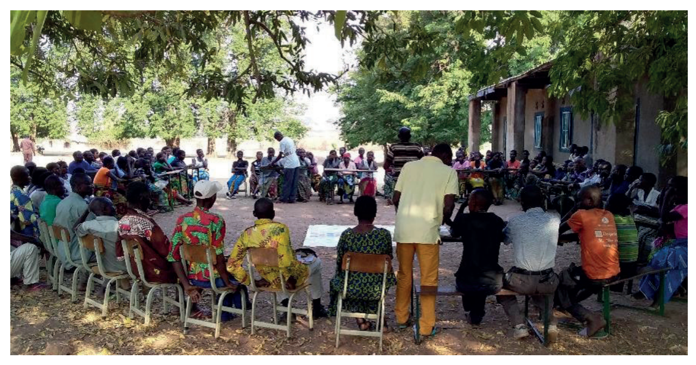
ABOVE: Creating awareness with parents on sexual and reproductive health activities within a school.

The introduction of the hotline has enabled staff to better understand what is going on in villages, the reasons for early pregnancy in children and questions around SRH that girls and boys may have. This information has enabled project staff to design activities which are more relevant.